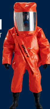
DM II Type 1-ET