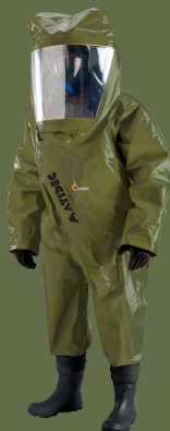
DM II Type 1-ET